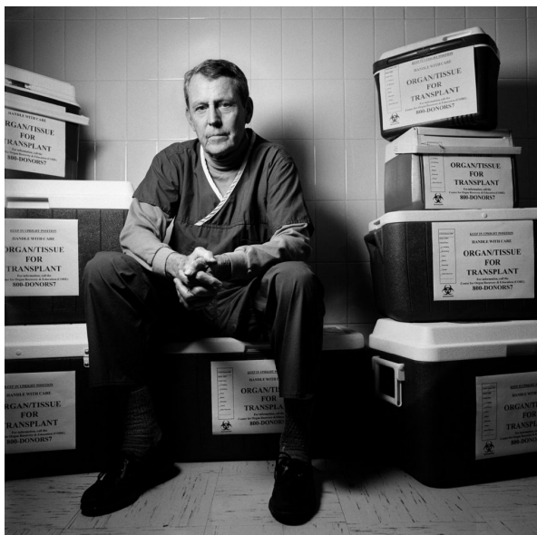
Dr. Starzl, father of modern transplantation

Even more extraordinary was his ability to gift that capacity to those around him, allowing his students and colleagues to discover the right stuff within themselves. Nobody who spent time with Thomas Starzl could remain unaffected. Including me!