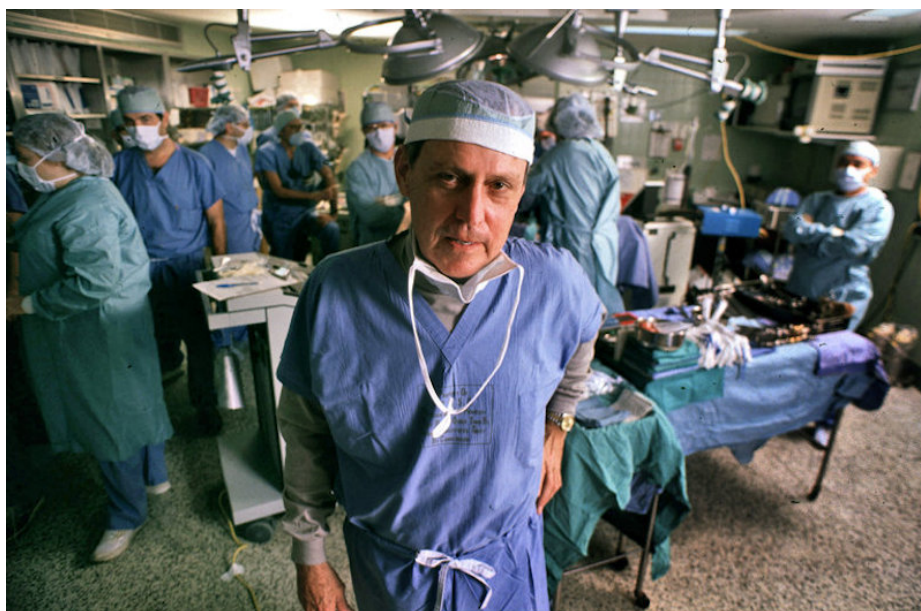
Dr. Thomas Starzl overseeing the amazing transplant team

My life changed in 2013 when I met Dr. Thomas E. Starzl. Dr. Starzl performed the first successful liver transplant at the University of Colorado in 1967. He spent the rest of his life saving lives, like mine.